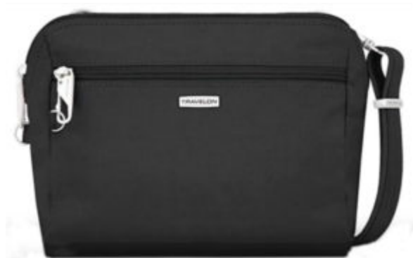
Figure 2 - Travelon Anti-theft Security Bag

Following that video, Trevor played another on China's Terracotta Warriors visit to the National Gallery of Victoria. That video can be found searching YouTube for "Terracotta Warriors visit Melbourne" or from the following URL, https://www.youtube.com/watch?v=RTaYnPgrqmg .