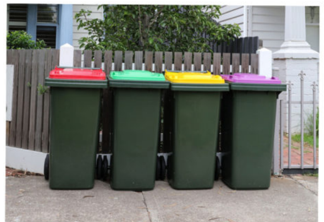
Figure 6 - Future Victorian recycling

Members attending were asked whether paper coffee cups were better for the environment than foam cups. Most answered paper cups, but they were wrong. Due to the manufacturing process paper cups are almost impossible to recycle due to the waterproof layer needed to hold liquids. Paper cups are usually 2