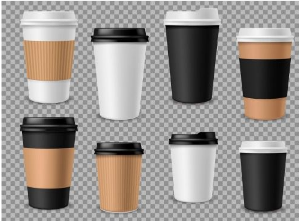
Figure 7 - Paper coffee cups

layers, need bleached board, have a polythene liner, use ink and often use a plastic lid. Foam cups on the other hand are 90% air and can be recycled. The manufacturing process of paper cups is shown in the video https://www.youtube.com/watch?v=-mclkw3TZWU . The solution for coffee drinkers is to bring their own collapsible reusable coffee cups. The use of reusable cups is increasing.