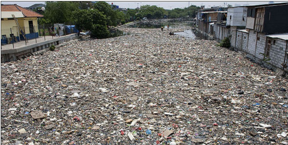
Figure 4 - Polluted Citarum River in Java

There are two significant problems Stuart sees in the plastics debate. Firstly caused by countries with little or no pollution control and plagued with corruption. Corruption causes a significant portion of the pollution problem. Secondly poorer communities whose people are just living to survive have no interest in pollution control. Their priority is what they have to eat the next day. This problem can only be solved by tackling poverty in these countries. To highlight these points Stuart showed a video of the world's most polluted river, the Citarum River in Java. https://www.youtube.com/watch?v=AkSXB-IRAp0 .