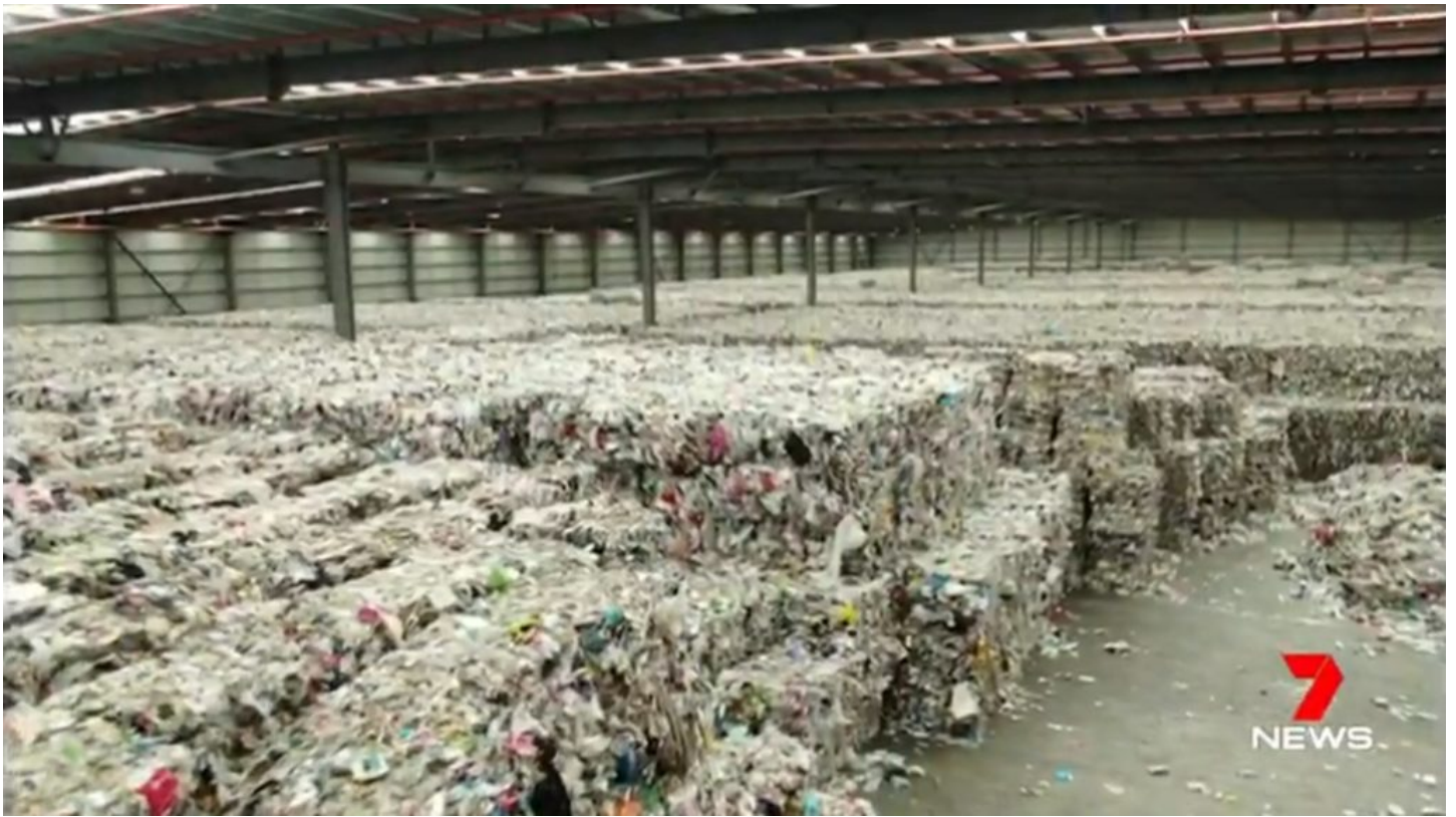
Figure 5 - SKM recycling Warehouse

With 60% of recycling going into landfill, governments have proposed a “National Container Deposit Scheme”, with Victoria’s scheme to commence in 2023. Potential problems are the size of deposit containers needed to store cans and plastic bottles. Large containers are needed as cans and bottles cannot be collapsed before being deposited. Glass will need to be sorted and plastics will need to be cleaned thus increasing water usage. Stuart can also see the rise of “bin divers” raiding street bins to collect the 10 cents deposit. The 4 bin scheme was another option councils are looking at to help make recycling more viable by reducing sorting.