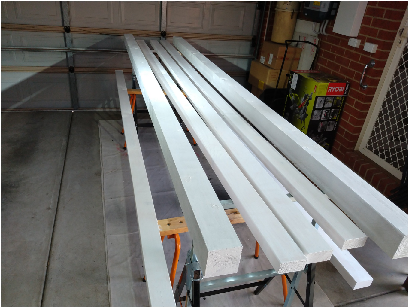
There is no substitute for the right quality of undercoating