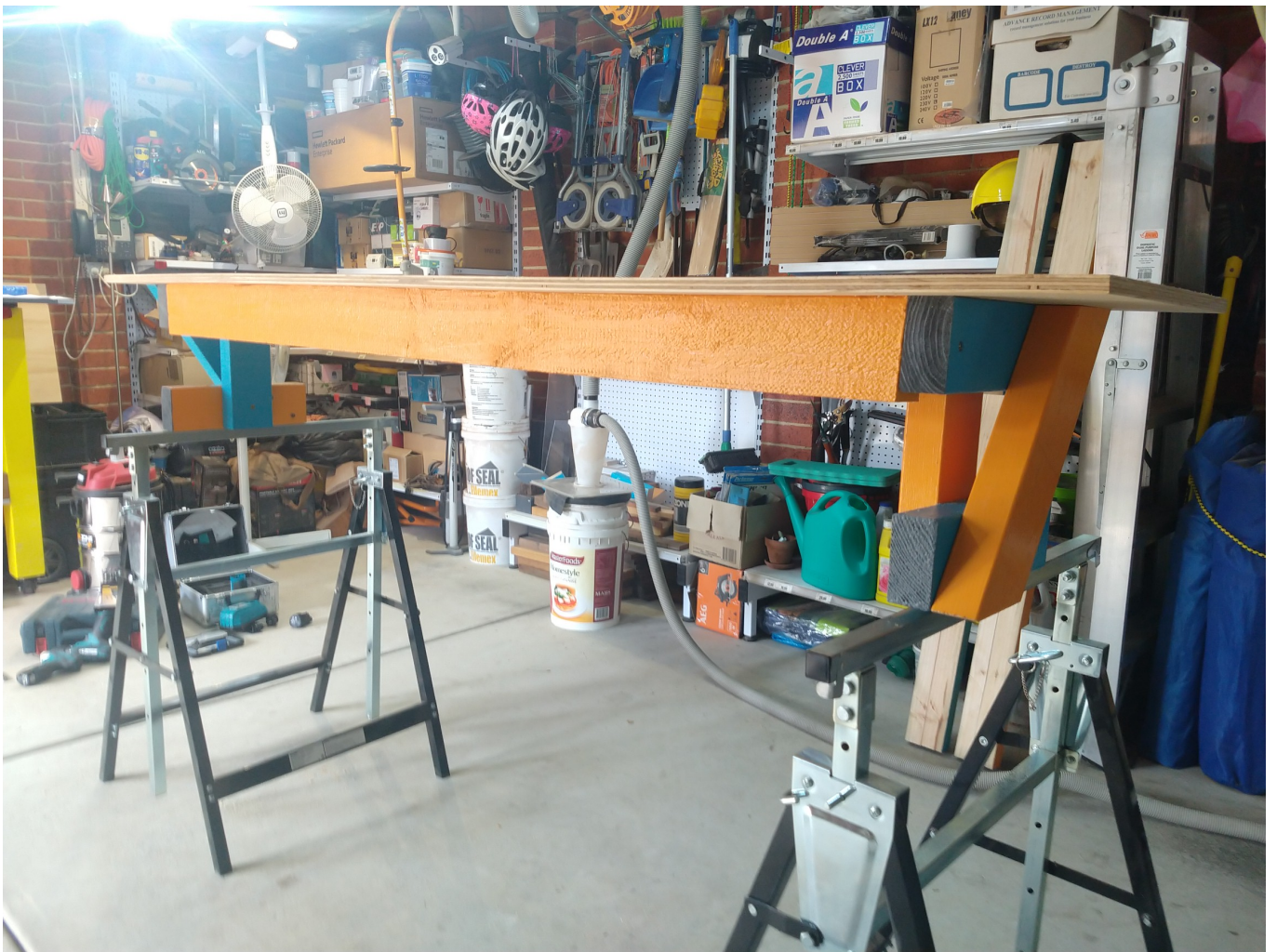
With some materials left over, a raised shelf for the workbench was in order