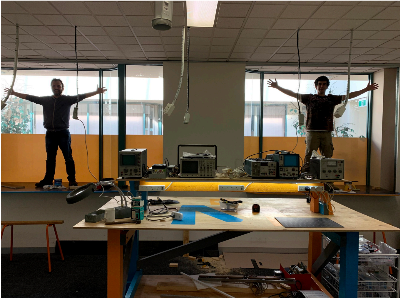
These boys were keen, they couldn't help themselves

As things get closer and closer to being able to say that the Maker Room is able to be handed back to all of you, the members, the project team has been buzzing with excitement. Maybe you'd like to use the space to build or design something, or maybe your children or grandchildren could learn from the many skilled members who know so much about such a diverse range of topics. Please go right ahead, that's what it's there for.