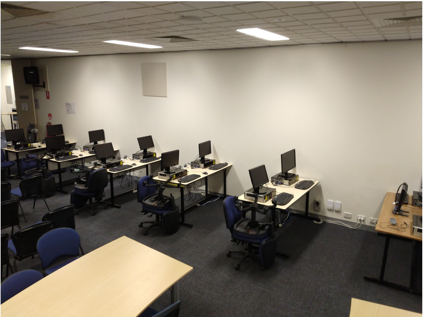
• Training Room computers neatly relocated to the Borrett Room