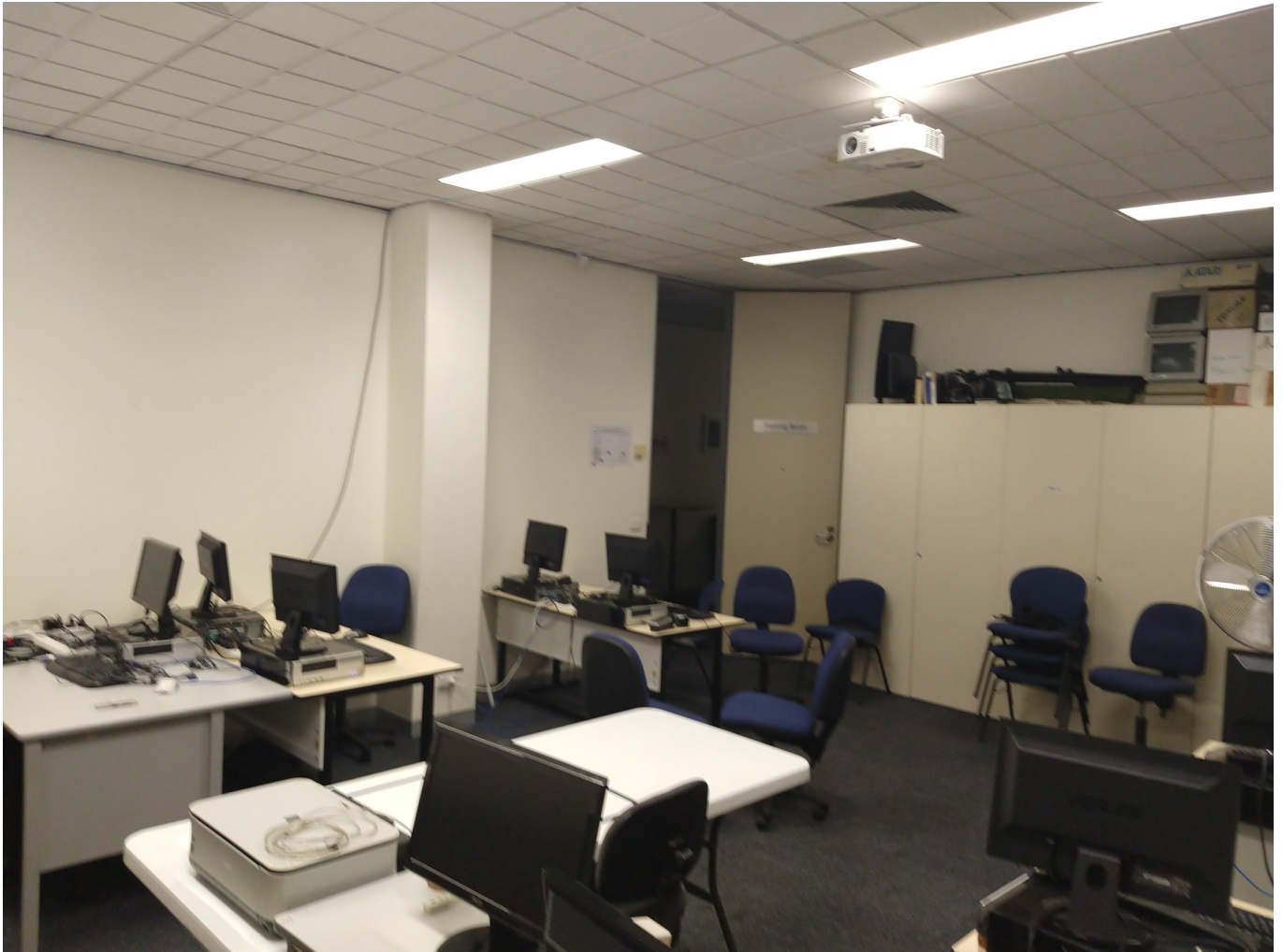
• A cluttered and underutilised space

You probably haven't been to the club in a while (thanks for everything, COVID), so your recollection of the training room might be outdated. The room was originally configured as part of our club's move into our Moorabbin premises, it was used for training sessions that utilised a traditional format where the trainer sat up the front, and students lined the rows at their computer desks.