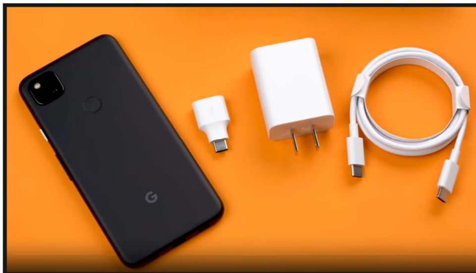
Figure 3 – Google Pixel 4A