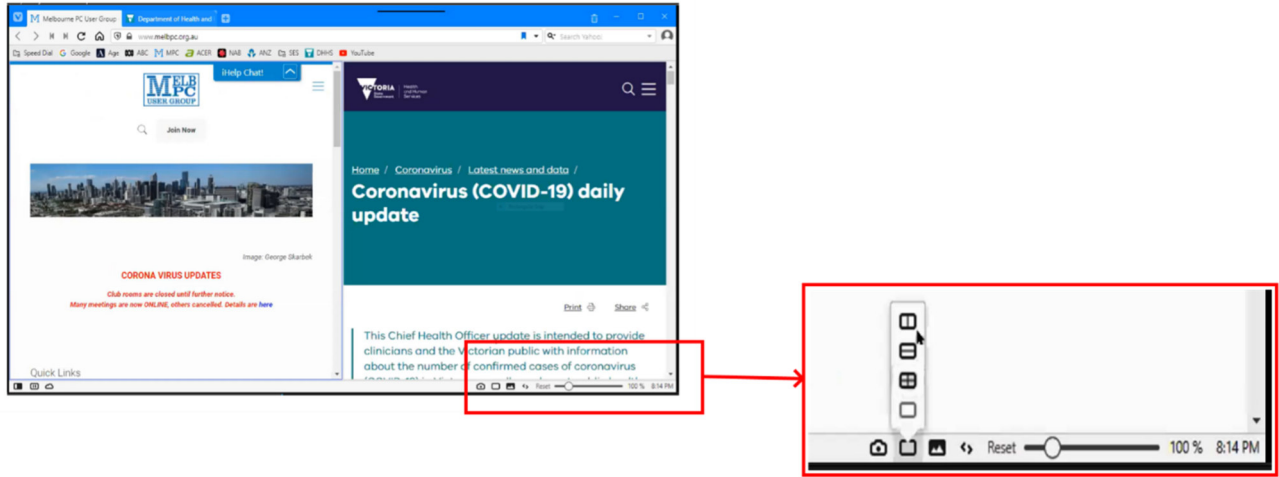
Figure 2 – Vivaldi Web browser twin page view

More recently Dave has been testing a web browser called Vivaldi. Vivaldi is open source and based on chromium. Dave thought he'd give Vivaldi a test run after reading a review that ranked it as one of the best of the current web browsers. The feature that Dave's found particularly useful is the ability to view 2 or more webpages side by side. Figure 2 below shows how two webpages can be split both horizontally or vertically. It's also possible to displaying 4 webpages simultaneously in a 2 x 2 grid.